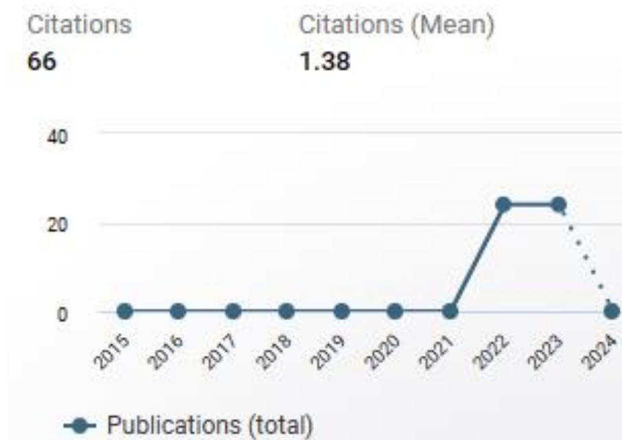
Fig. 2. Distribution of citations in Dimension

In Dimension, all 48 investigated articles are accessible with 66 citations and 1.38 average citations (Fig. 2):