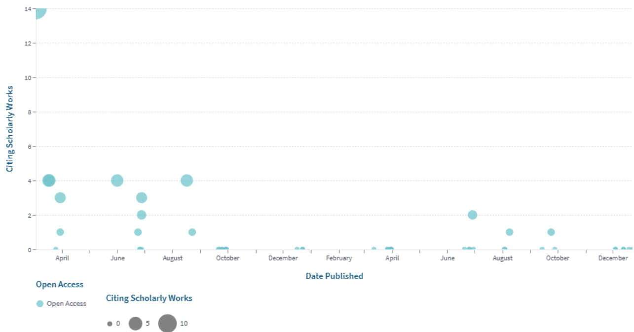
Fig. 3. Distribution of citations in Lens database

The author can state that different databases have different grouping and segregation methods that automatically and independently categorise the journals. The Lens database shows that citations are not evenly distributed over time. Older articles are attracting more citations that are well known in conservative scientific disciplines (Fig. 3.):